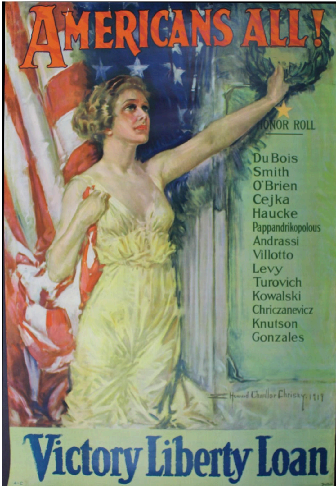
"Americans All!," 1919. (The Gilder Lehrman Institute, GLC09676.02)